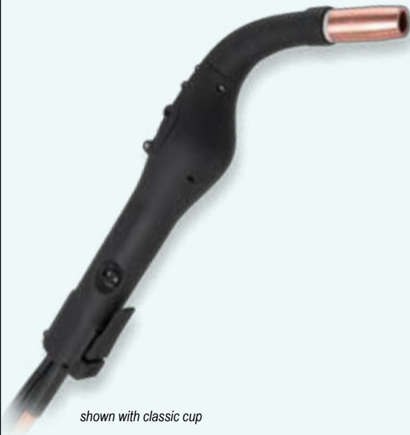
shown with classic cup

The NEW Cobra® MX Patented Design is intended for all Cobra® gooseneck welders. Familiar with Cobra® Gold? Cobra® MX is a direct replacement with a gas valve in the gun and with all of MK Products' latest features and manufacturing techniques. Cobra® MX is manufactured in Air or Liquid Cooled models and is available with 1/4" or 3/8" consumables. Capable of most any aluminum welding job, Cobra® MX is in a class by itself. This gun features our famous push-pull gooseneck design and weighs only 2 lb 5 oz. The Patented Cobra® MX is ready to fit all your aluminum and hard wire welding needs.