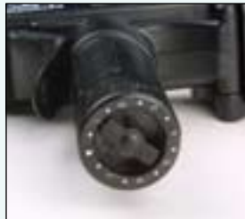
3¾ turn pot