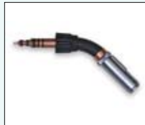
Optional Liquid Cooled 45° barrel

Rated Output determined by the gun having an Air Cooled (A/C) or Liquid Cooled (L/C) barrel.