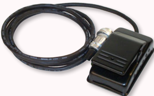
The AirCrafter™ T-25 comes with a variable speed foot control.