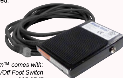
The CobraTurn™ comes with: On/Off Foot Switch 005-0747

* See manufacturing specifications for details