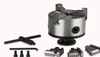
005-0040 Self-Centering 3-Jaw Chuck Includes two sets of manually adjustable jaws from 7/8" - 3 3/4" internal and 1/8" - 4" external clamping.