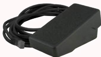
005-0746 Heavy Duty Variable Speed Foot Control